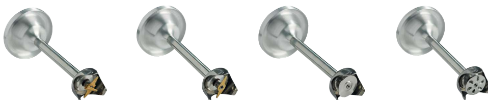
Emulsifying knife - 4 blades Ref. : AC530