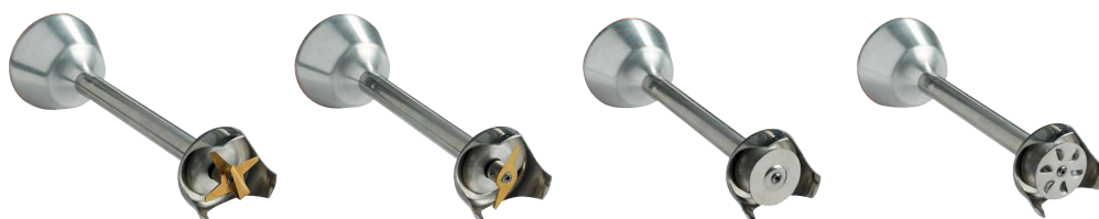
Emulsifying knife - 4 blades Ref. : AC520