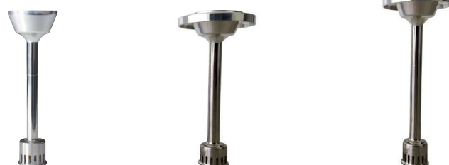
Ref. : AC560